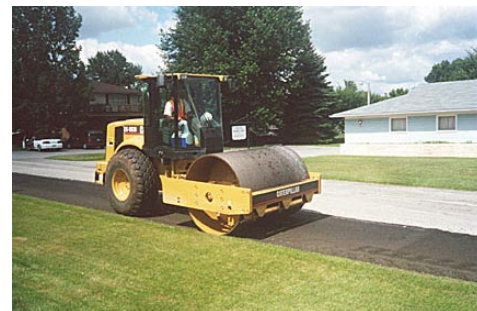
Figure 3. Rolling and compaction

For more information, contact The Dow Chemical Company Customer Information Group at 1-800-447-4369 or visit www.dowcalciumchloride.com .