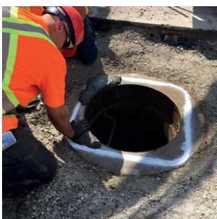
Envirobed is placed on the supporting structure. The frame is lowered into position.