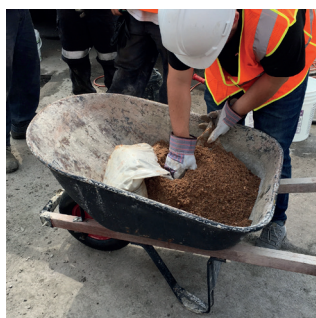
Apply QC10 F backfill concrete once mortar has set.