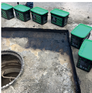
Spray all vertical edges and substrate with SCJ seal and tack coat spray.