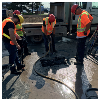
The picture frame is saw cut, excavated and the existing frame and cover removed.