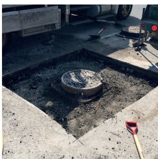
Old bedding mortar, loose bricks and debris are removed.