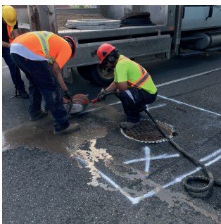
A picture frame is marked around the manhole.

The following installation method will ensure a right first time repair, reduced maintenance costs and extended life service. Allows sites to be open to traffic in as little as 2 hours!