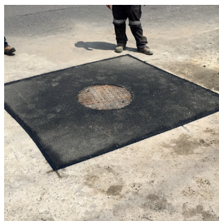
Once Instant Road Repair is level with existing road surface, apply Instaband ECO thermoplastic overbanding tape.