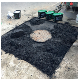
Apply Instant Road Repair cold lay asphalt concrete using a 50% surcharge. Compact to required depth.